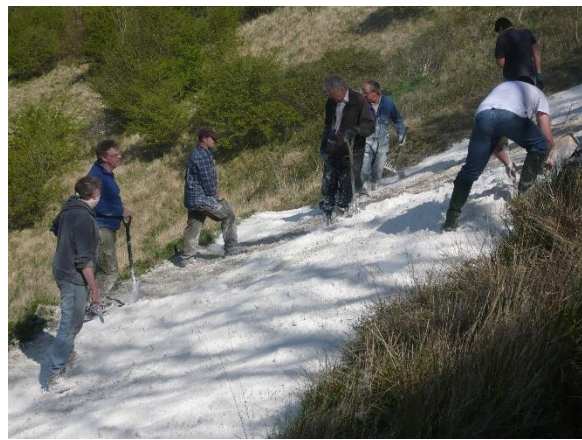
Figs 9 and 10: Weeding and Liming in 2011