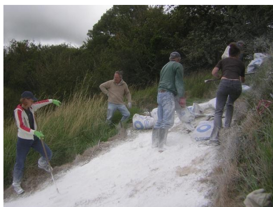
Figs. 7 and 8: Photographs of the 2007 restoration work before and after liming