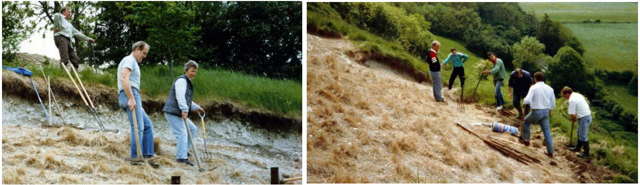
Figs. 2 and 3: Restoration initial stages 1991

A set of two photographs exist which show a number of people on a grass/weed covered white horse with rakes, picks and long metal stakes. They are digging out an outline linear trench at the bottom of what appears to be the horse's body.