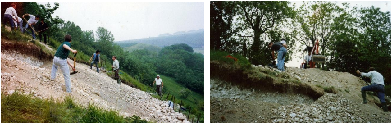
Figs. 4 and 5: Restoration later stages 1991

Then there are two additional photographs which show the horse surface devoid of grass/weed. A small JCB type digger can be seen at the top of the hill emptying its load onto the slope immediately above the horse. People are using shovels and rakes to cover the surface (starting from the bottom up) with what appears to be chalk rubble. The stakes can be seen vertically in their position on the hillside along the previously excavated linear trench. The chalk rubble is piling up against the stakes (and the chicken wire between the stakes).