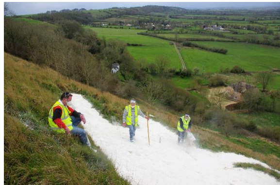
Figs 12 and 13: Reduced team maintaining the horse 2016