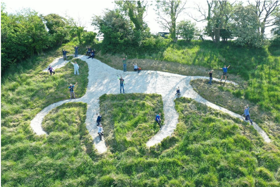
Fig 17: Broad Town White Horse Restoration Group volunteers in May 2025

This is not the end of the Broad Town white horse story nor its associated Restoration Group, but simply the end of its history up to the present in November 2025.