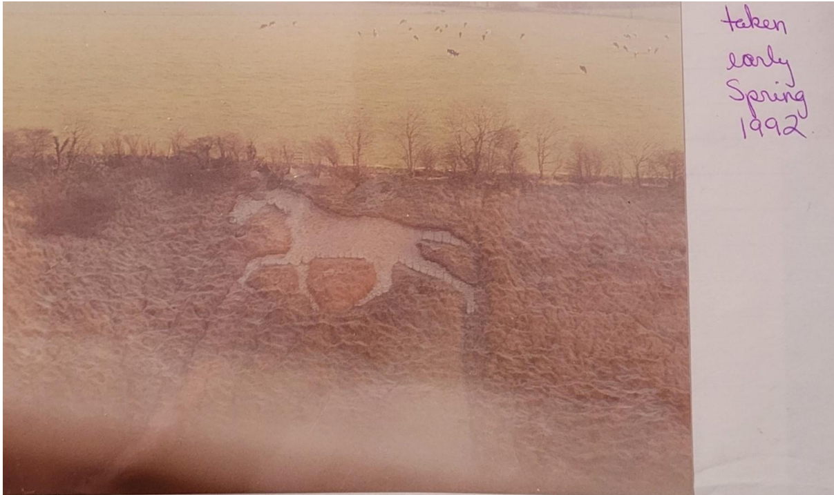
Fig 1: Aerial photograph of Broad Town white horse 1992