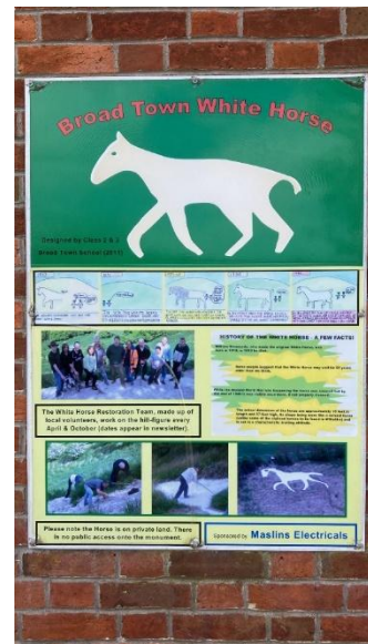
Fig 11: School Board

Apparently 2012 was a frustrating year as scouring and liming was interrupted by poor weather. Thus the next event in April 2013 was arranged to take double the usual time in order to repair and present the horse in a good state [Ref 34].